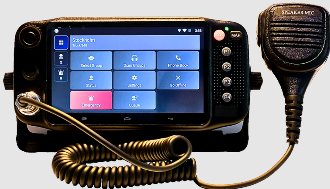
GroupTalk Vehicle Radio